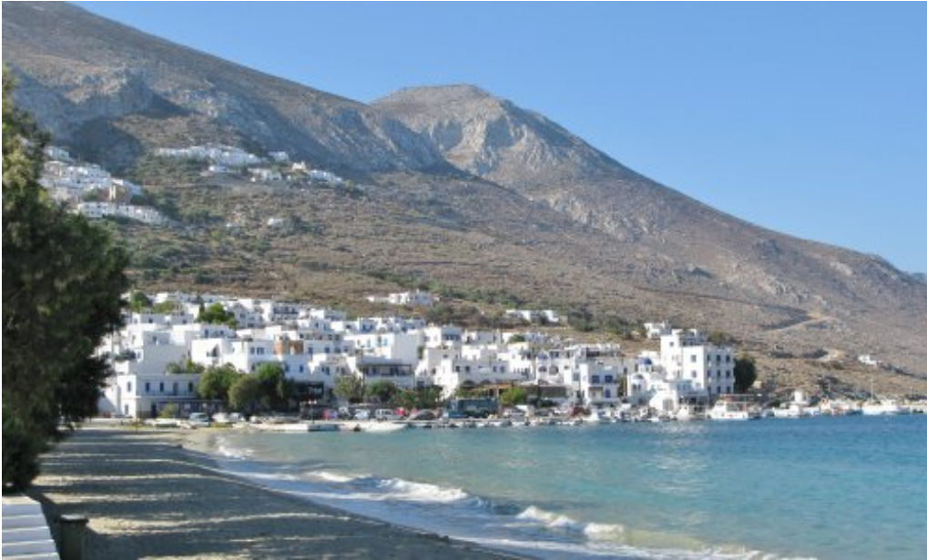
Amorgos island, Greece